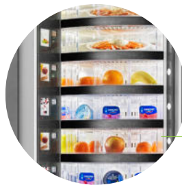
Flexible snack, food and drinks offer