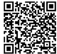
Energy Label Available with this QR code