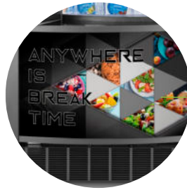
A simple design for a true automatic canteen