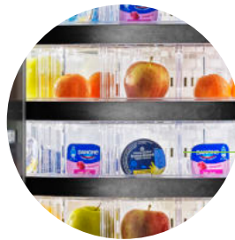
Variable temperature options